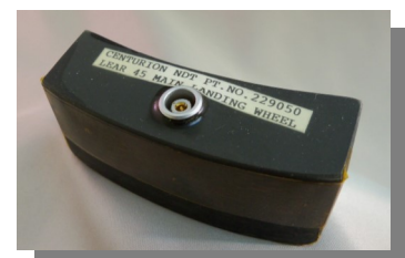
Shown with LEMO Connector

** For LEMO connector, add "L" to part number i.e. 229044L